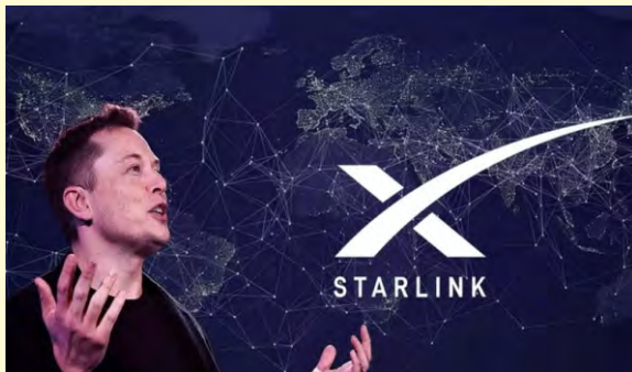
ELON MUSK'S FIRM, STARLINK, GETS ISP LICENCE TO OPERATE IN NIGERIA