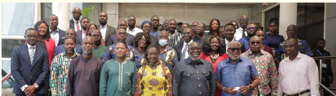
A group photograph of some participants with Deputy Minister for Communications and Digitalisation