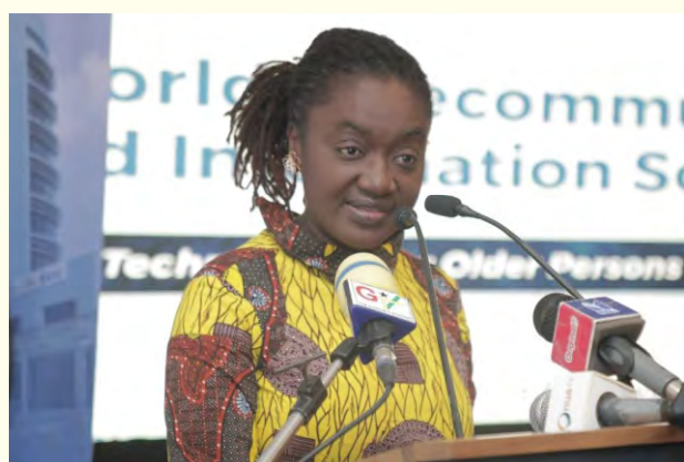
Deputy Minister for Communications and Digitalisation, Hon. Ama Pomaa Boateng, delivering a keynote address

Mr. Anokye stated that the Government of Ghana and the Ministry of Communications and Digitalisation (MOCD) have anchored digitalisation as a key policy objective and have also initiated several programmes within the different sectors of Ghana's economy tailored at bridging the digital divide. He added that the policies are what make technological innovations possible in all fields including finance, health care and education.