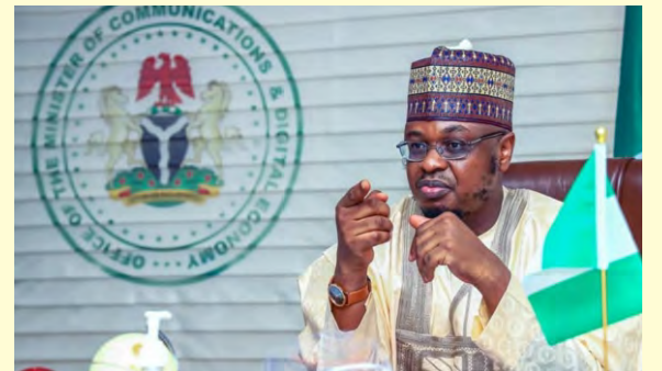
NIGERIAN GOVT. APPROVES TAX RELIEFS FOR TECH STARTUPS TO BOOST DIGITAL ECONOMY