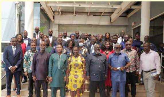
NCA COMMEMORATES 2022 WORLD TELECOMMUNICATION AND INFORMATION SOCIETY DAY (WTISD)